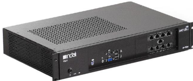
Fig. 1: indali M system

Equipped with redundant storage and redundant power supply units, the indali M provides for utmost system availability needed in a business environment.